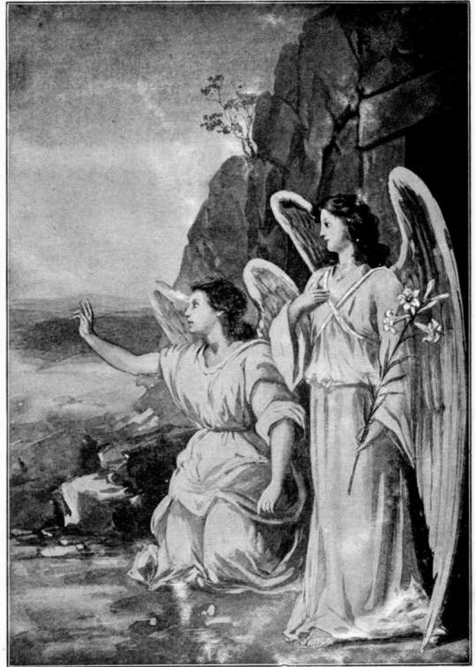
ANGELS AT THE TOMB—HE IS RISEN.

“Then came the soldiers, and brake the legs of the first, and of the other which was crucified with him. But when they came to Jesus, and saw that he was dead already, they brake not his legs: but one of the soldiers with a spear pierced his side, and forthwith came there out blood and water. And he that saw it bare record, and his record is true: and he knoweth that he saith true, that ye might believe. For these things were done, that the scripture should