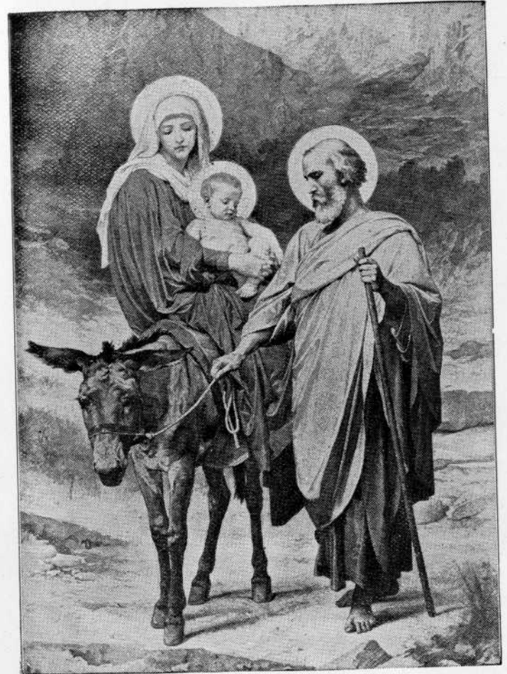
JOSEPH AND MARY GOING TO EGYPT.

“And Simeon blessed them, and said unto Mary his mother, Behold, this child is set for the fall and rising again of many in Israel;