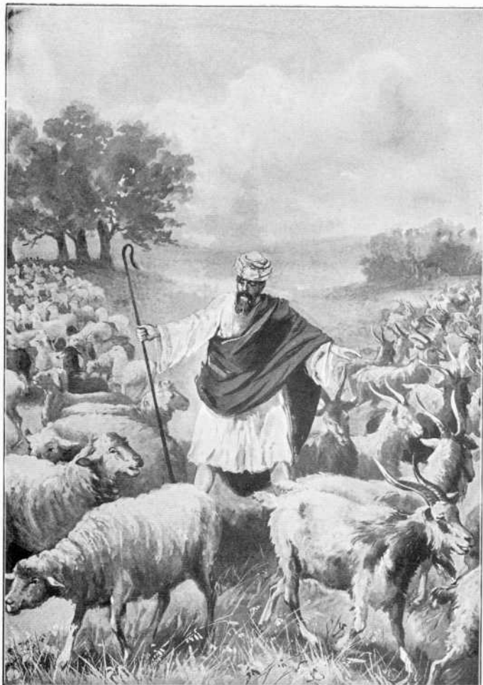
SEPARATING THE SHEEP FROM THE GOATS.