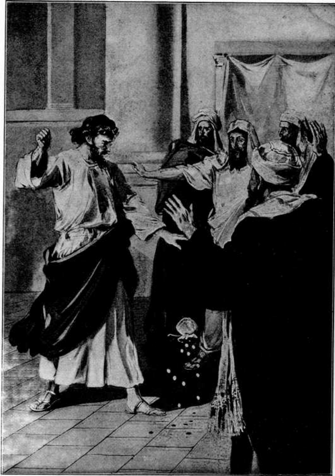
JUDAS THROWS DOWN THE THIRTY PIECES OF SILVER.

priest answered and said unto him, I adjure thee by the living God, that thou tell us whether thou be the Christ, the Son of God.