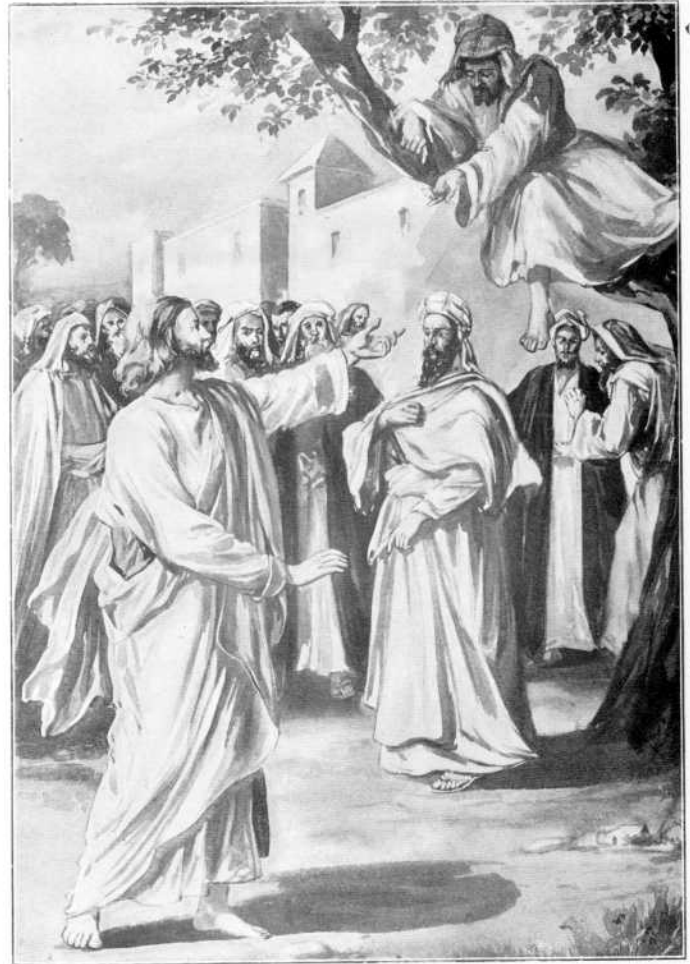
THE CONVERSION OF ZACCHÆUS.

"And they come to Jerusalem: and Jesus went into the temple, and began to cast out them that sold and bought in the temple, and overthrew the tables of the moneychangers, and the seats of them that sold doves; and would not suffer that any man should carry any vessel through the temple. And he taught, saying unto them, Is it not written, My house shall be