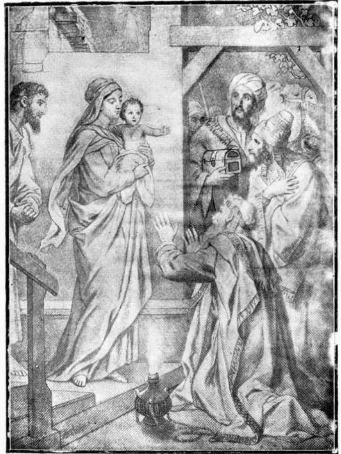
THE WISE MEN WORSHIPPING THE BABE.

The Lord, knowing Herod’s evil thoughts and intent, told the wise men in a dream not to go back to tell the king about what they had found and seen at Bethlehem. Therefore when they returned home, they went another way in order to avoid meeting King Herod.