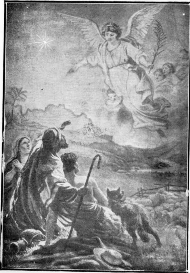
ANGELS TELLING THE SHEPHERDS.

Not only were the shepherds that were watching their flocks told the glad tidings, but the wise men also were informed about the things that had happened, and coming from the east, these men saw the star resting over the place to guide them to the spot where they would find